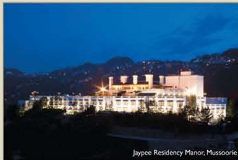
Jaypee Residency Manor, Mussoorie