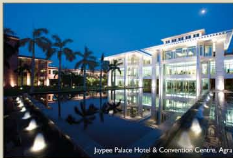
Jaypee Palace Hotel & Convention Centre, Agra