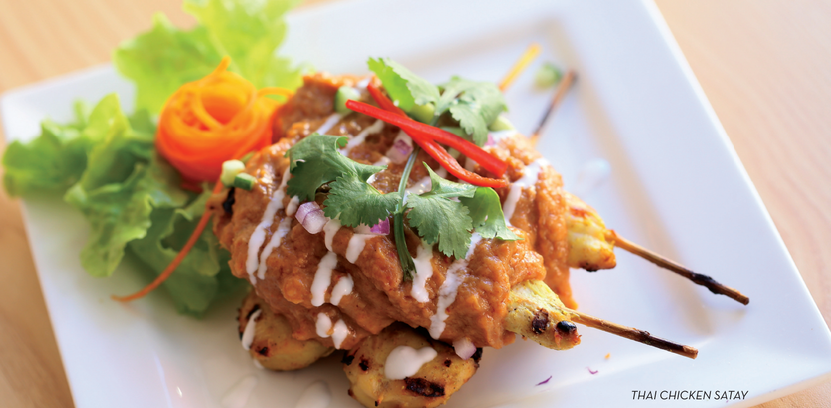
THAI CHICKEN SATAY